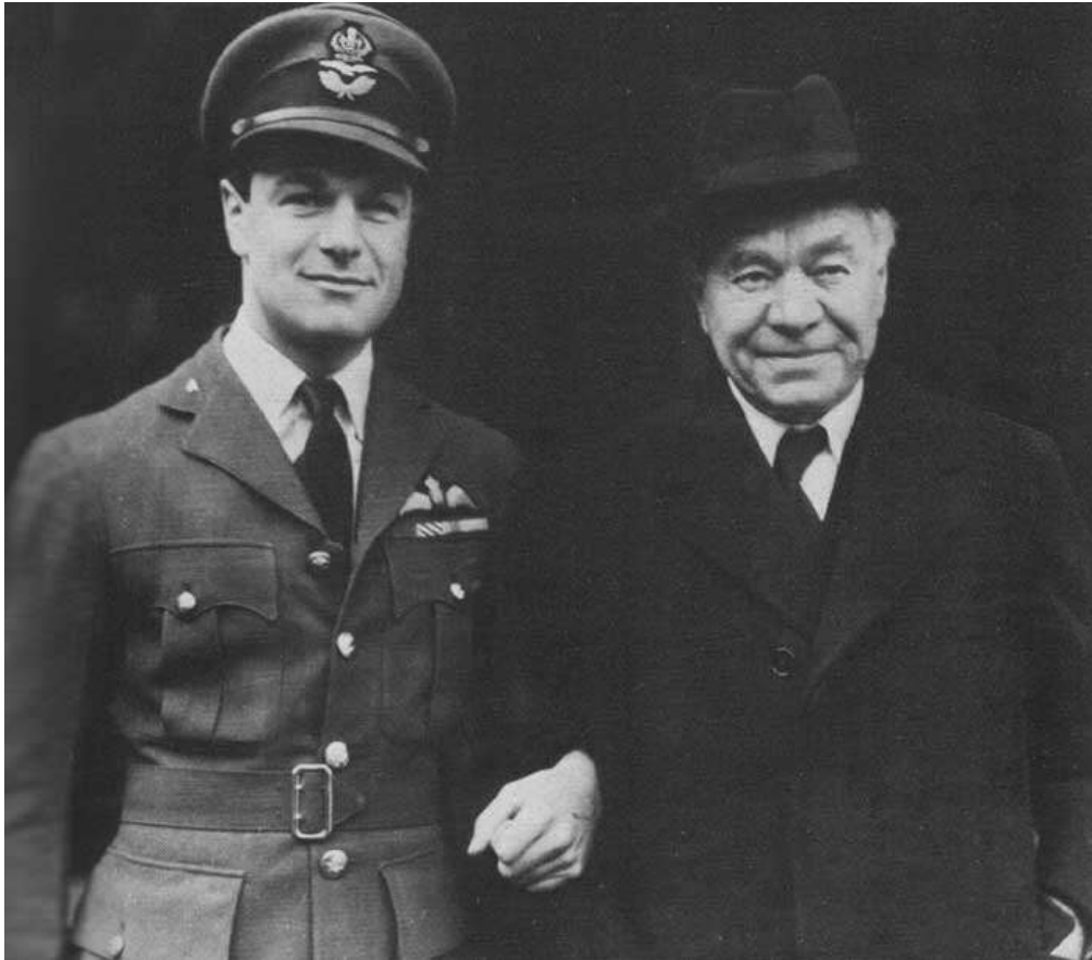
Max Aitken with his father Lord Beaverbrook. Max senior was Churchill's Minister of Supply & Minister for Aircraft Production

That month Wing Commander Aitken was posted to command No.68 Squadron at Catterick, north Yorks, that was working up in the night-fighter role with radar-equipped, but nevertheless, obsolete Blenheim IIs. Manned mainly by Czech aircrew, No.68 received its first AI Mk.IV equipped Beaufighter Mk.IIs during May, which by the month's end had completely replaced the old Blenheims. Although declared operational during April 1941, the Squadron did not claim its first success until the 17 th June, with Aitken claiming a Bf 109 on the 25 th during a sweep over Northern France in a Spitfire borrowed from No.610 Squadron.